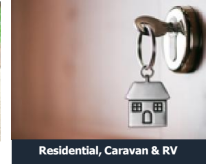
Residential, Caravan & RV