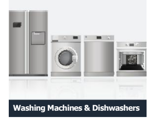
Washing Machines & Dishwashers